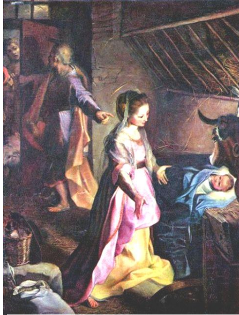
The Birth of Christ, Federico Barocci, 1597

December 25 th , 2025 10:30AM The Feast of the Incarnation